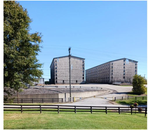
Four Roses (left) and one of many storage sheds at Wild Turkey

We then drove home via Frankfort and US Route 127 until we reached I-71 near Owenton. We then took the expressway home, arriving about 2pm after a very nice short break.