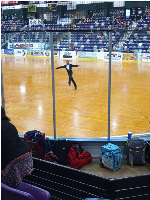
One of a handful of male competitors