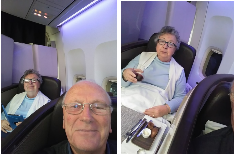
Onboard Virgin Atlantic

We left home at 11am, returned the rental car and checked in for our 2:30 flight to New York. We had had a drink in the lounge and had reached the gate before we were informed of a delay. It soon became obvious that we would miss our connection at JFK, so we were rerouted via Atlanta. Despite a 50-minute scheduled connection here, we made our onward Virgin Atlantic flight to Manchester with ease.