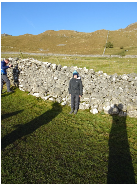
A Walk to Malham Cove