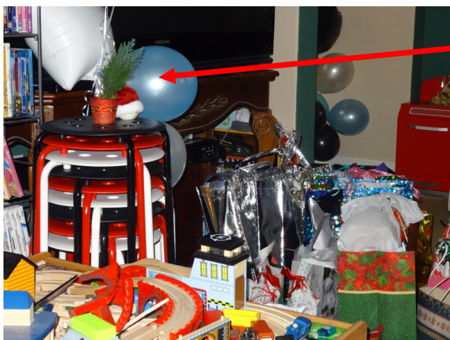
Not your typical Cyndi Christmas Tree

spent about two hours exchanging gifts among the seven of us.