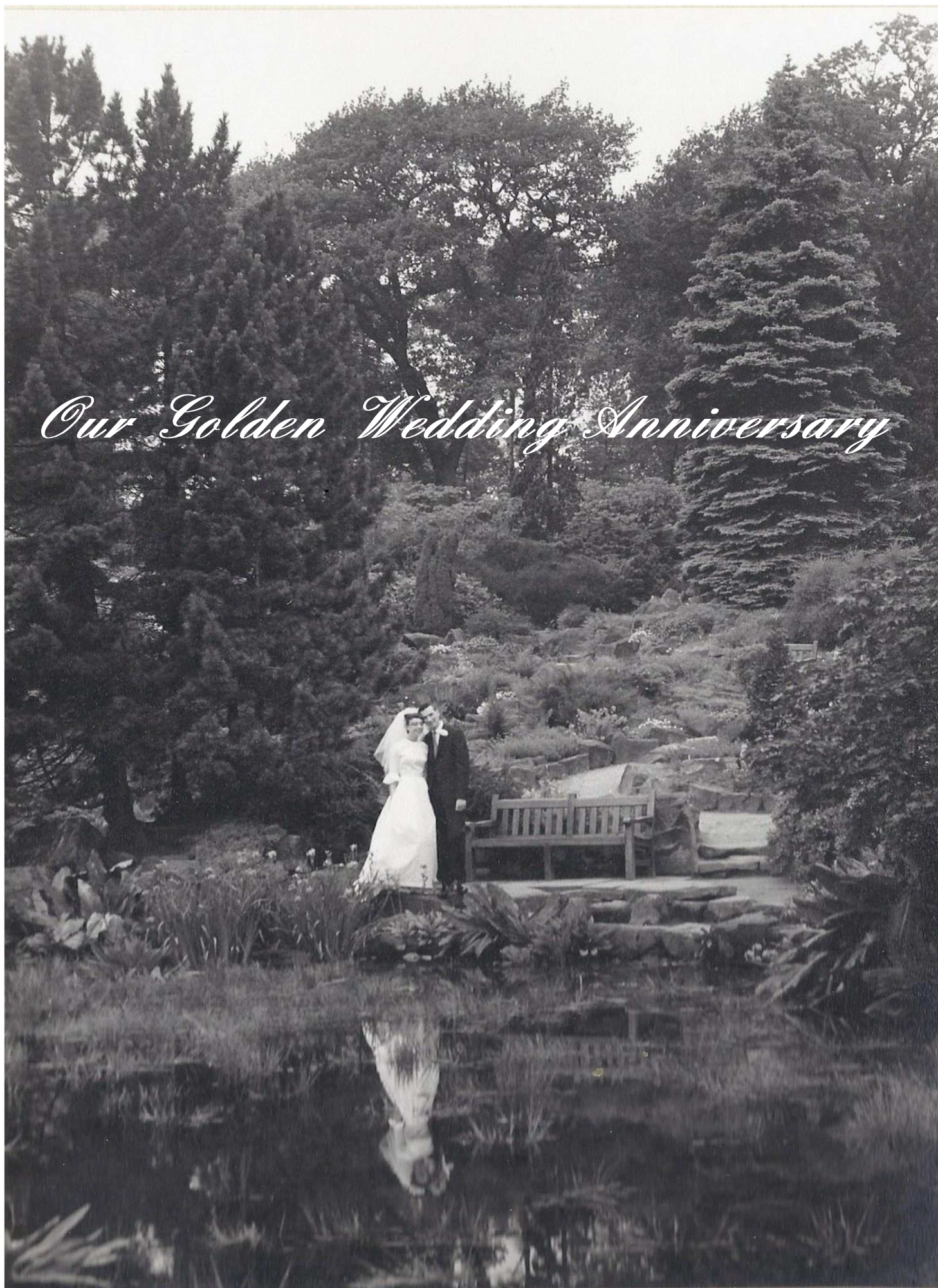
Our Golden Wedding Anniversary